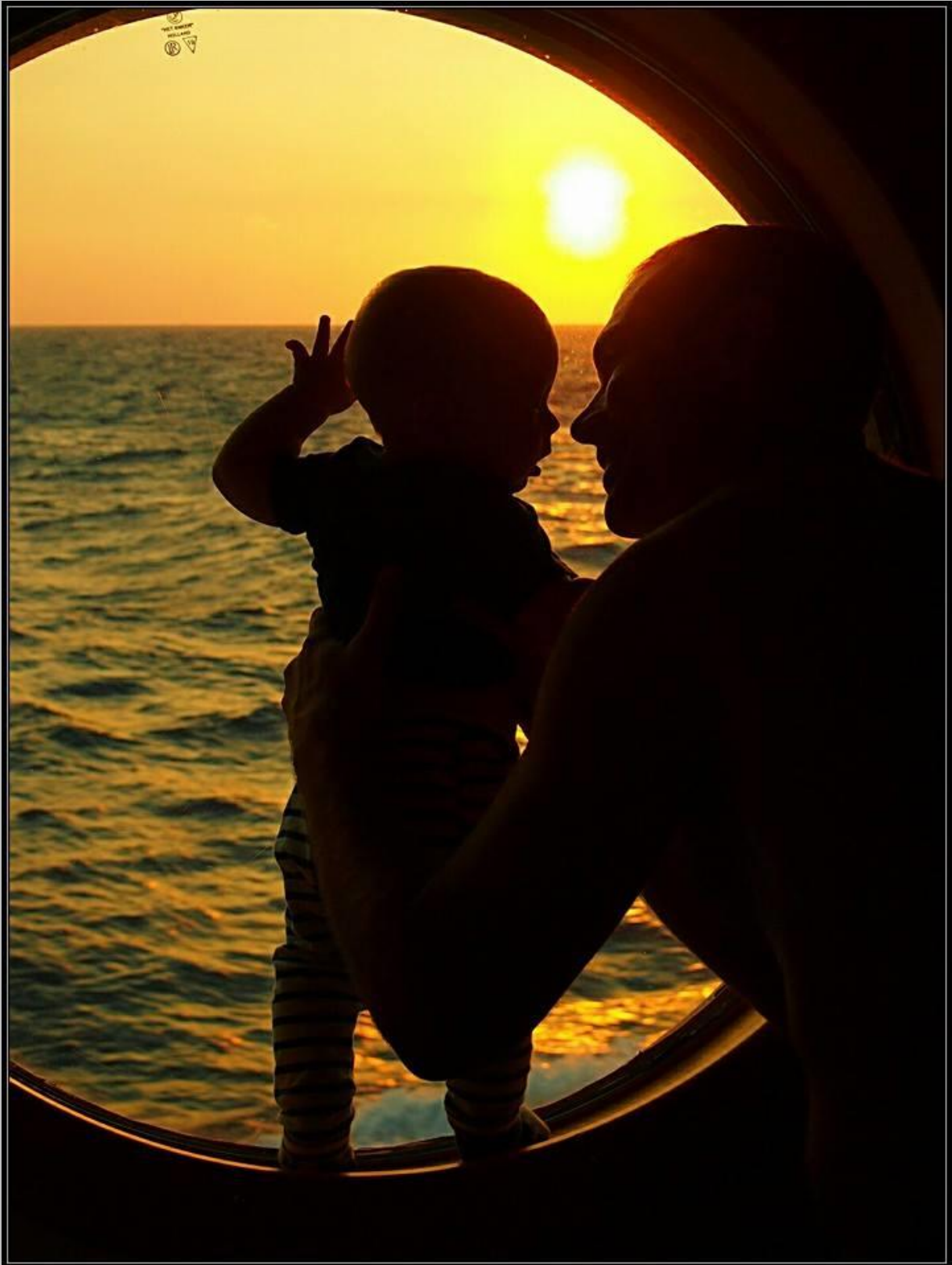
Sunset through the porthole