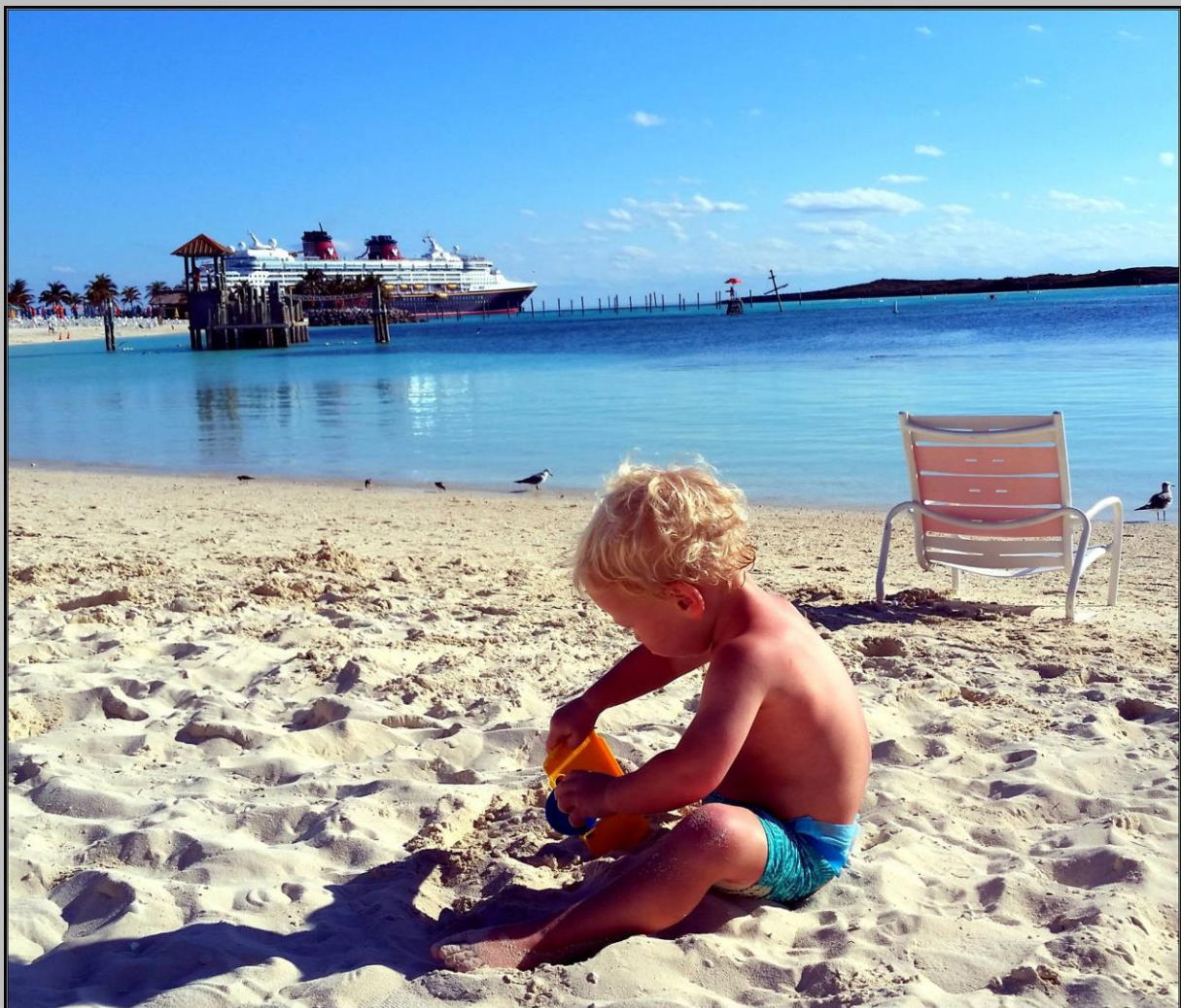
A boy playing on the beach at Castaway Cay in the Bahamas – a popular stop for Disney cruise ships