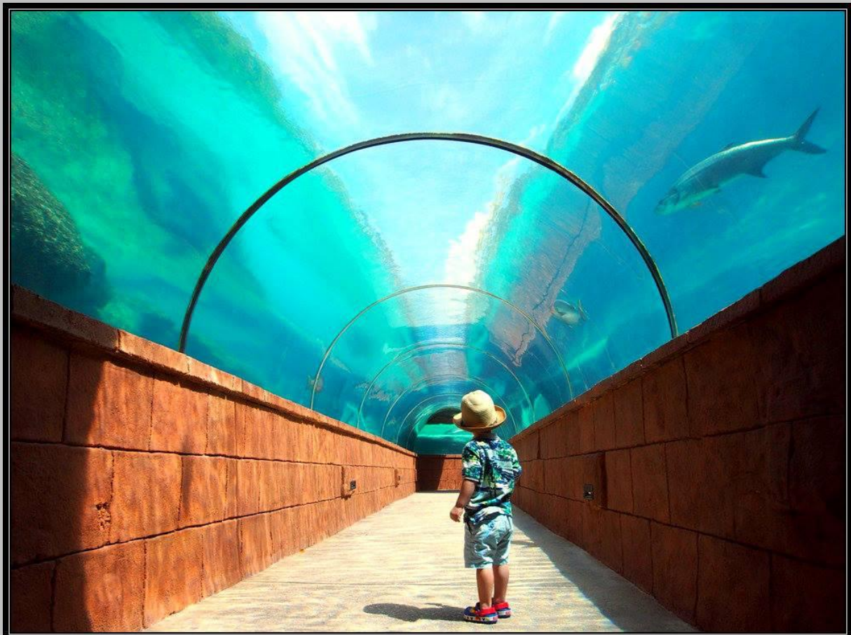
Paradise Beach and Atlantis Resort in Nassau (Bahamas) is a popular excursion for cruise passengers

Abstract: Given the importance of the cruise segment in the tourism industry and the limited number of prior studies in the area, this study empirically explores the structure of customer satisfaction with cruise-line services by evaluating the attributes of cruises that are significant to passengers. Using 44,993 voluntarily provided customer reviews published on a cruise guide website, a stepwise regression analysis is conducted to examine the effects of the attribute performance of cruises on customer satisfaction and dissatisfaction. The findings empirically confirm the validity of the two-factor theory of customer satisfaction in the cruise tourism context. The asymmetric relationship of some attributes makes it possible to identify dissatisfiers, satisfiers, and hybrid factors for the cruise industry overall and cruises on ships of different tonnage. The results can help managers in the cruise industry understand what aspects of cruises should be given more attention to improve their competitive edge. This study is one of the first to look separately at the determinants of customer satisfaction and dissatisfaction in the emerging cruise industry and proves that the two-factor theory is applicable in a new environment.